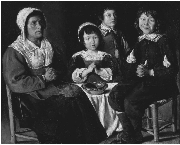
Antoine Le Nain (French, ?-1648). Le Bénédicite (The Blessing) . n.d. Oil on copper. Frick Art & Historical Center.

People who enjoy art often have to be detectives. They may want to know when a painting was created, what it is a picture of, or who the artist was. For some paintings the answers are easy, but for others it takes lots of research to figure out their secrets.