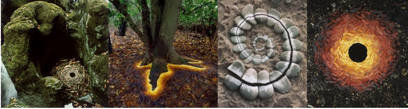
photos of artwork by Andy Goldsworthy

Many artists turn to the outdoors for inspiration when they make art. Artists such as Andy Goldsworthy are known for their artwork called environmental art or land art. You can see pictures of his artwork above. Land art is art made from things found in nature, arranged in whatever design you come up and then left in nature for everyone to enjoy!